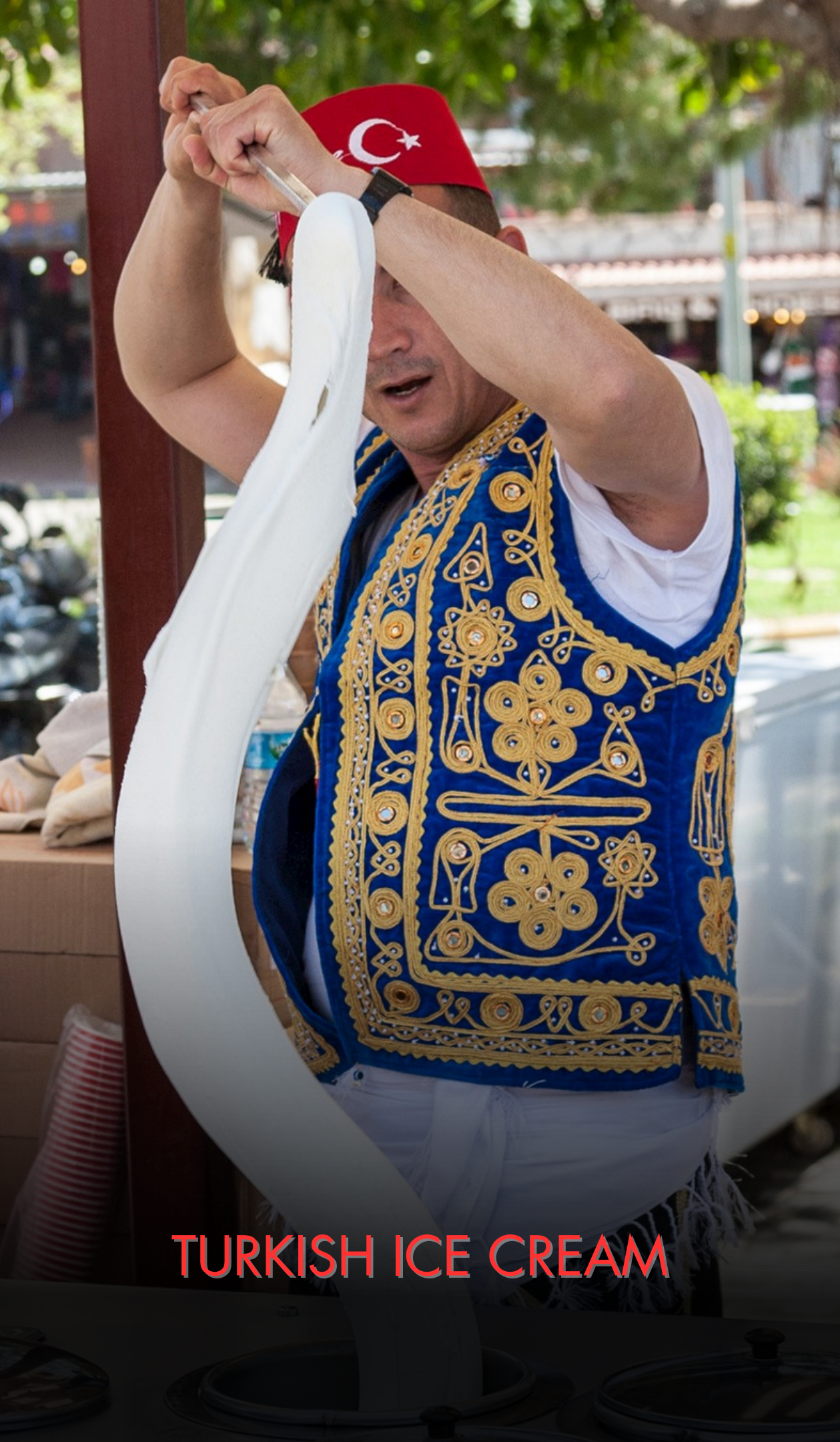
TURKISH ICE CREAM