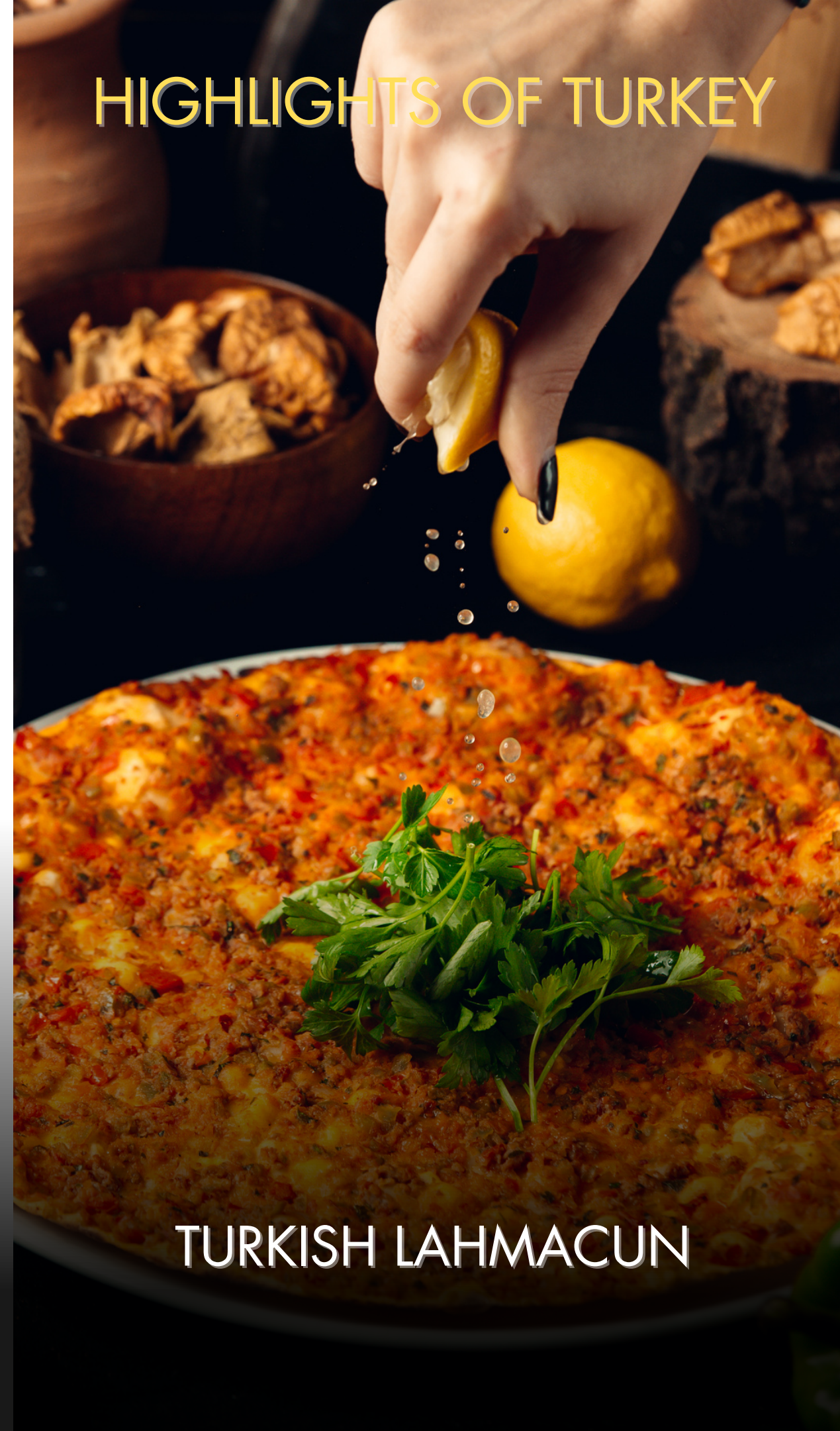
HIGHLIGHTS OF TURKEY