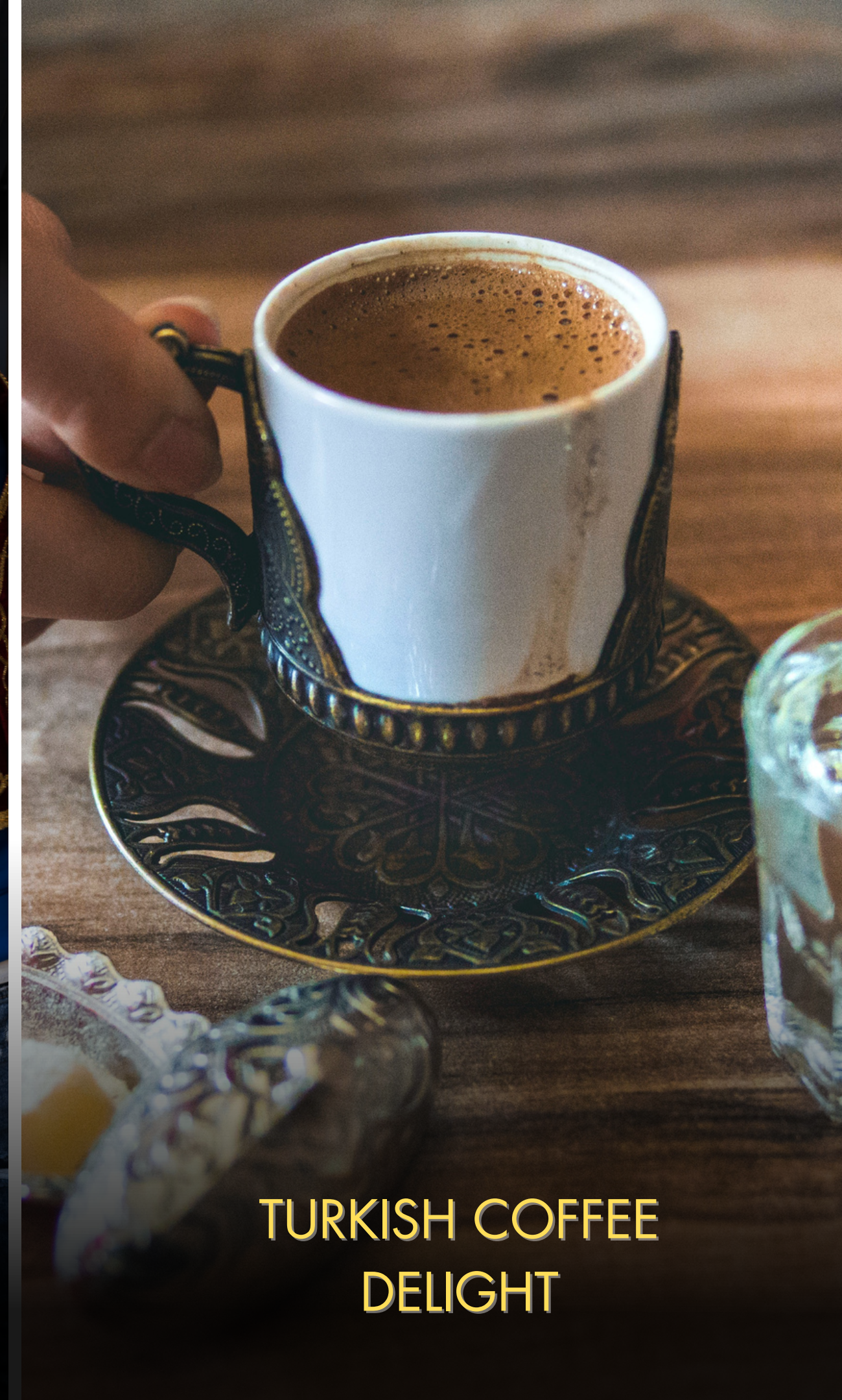
TURKISH COFFEE DELIGHT