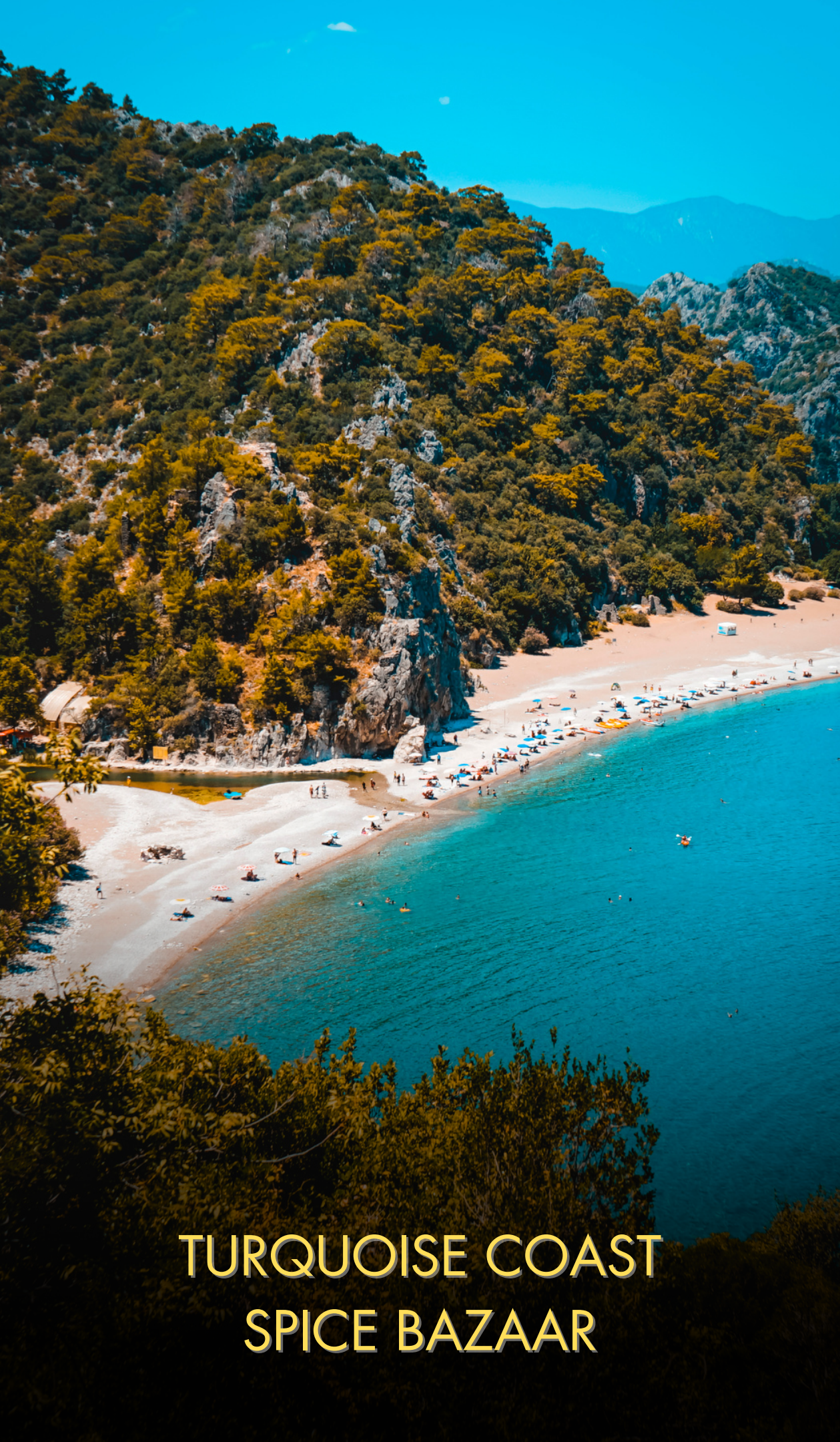
TURQUOISE COAST SPICE BAZAAR