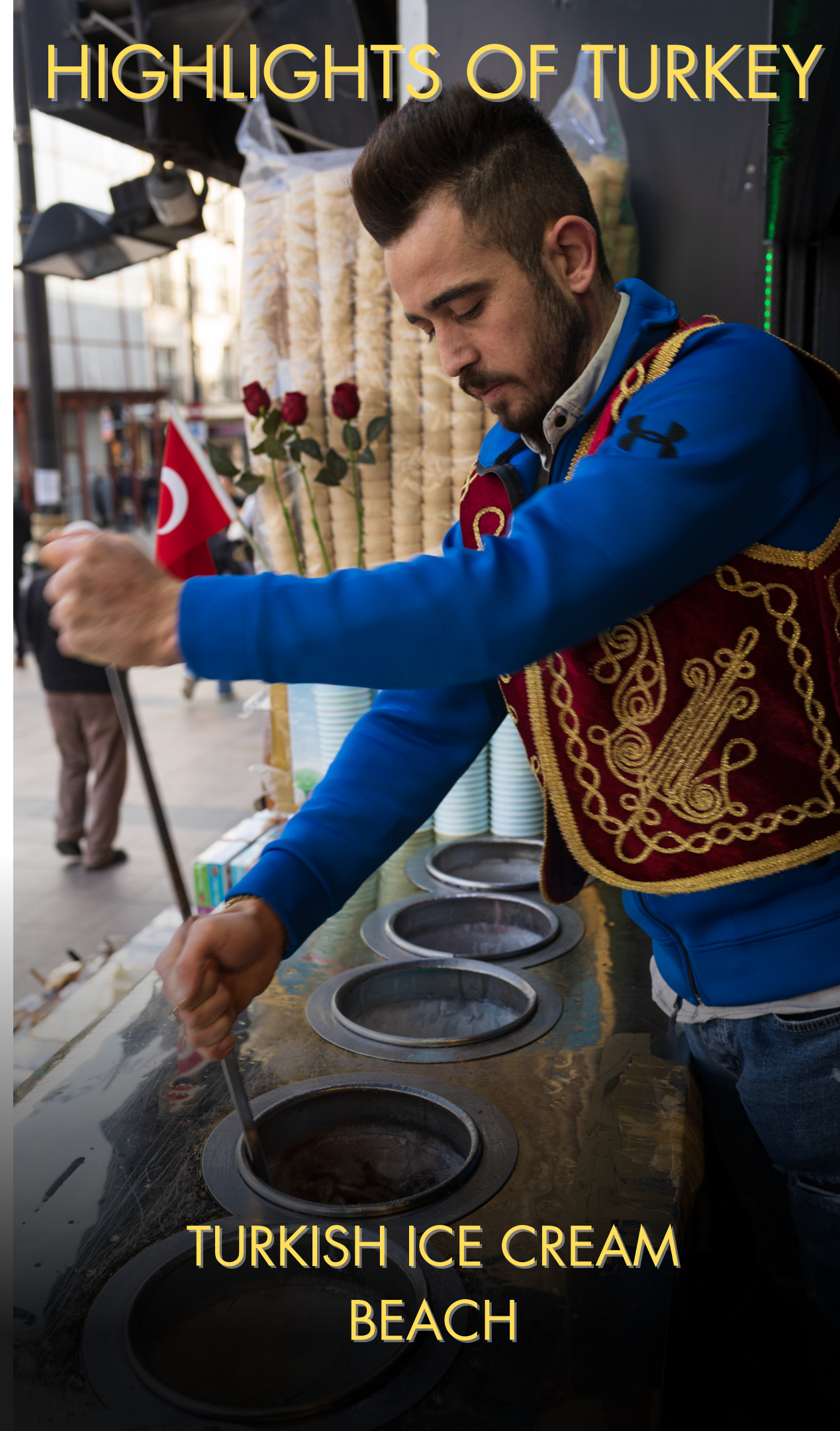
TURKISH ICE CREAM BEACH